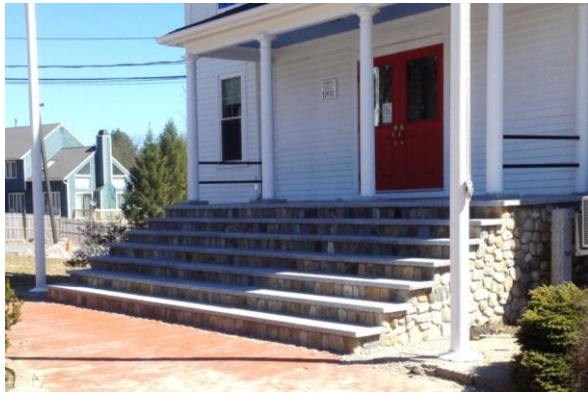
Town Hall Steps $ 45,000