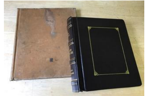
Conservation of Historic Town Records $23,000