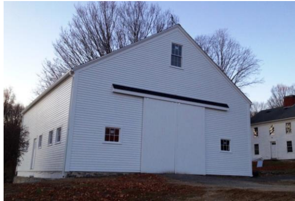
Steele Farm Barn $ 90,000